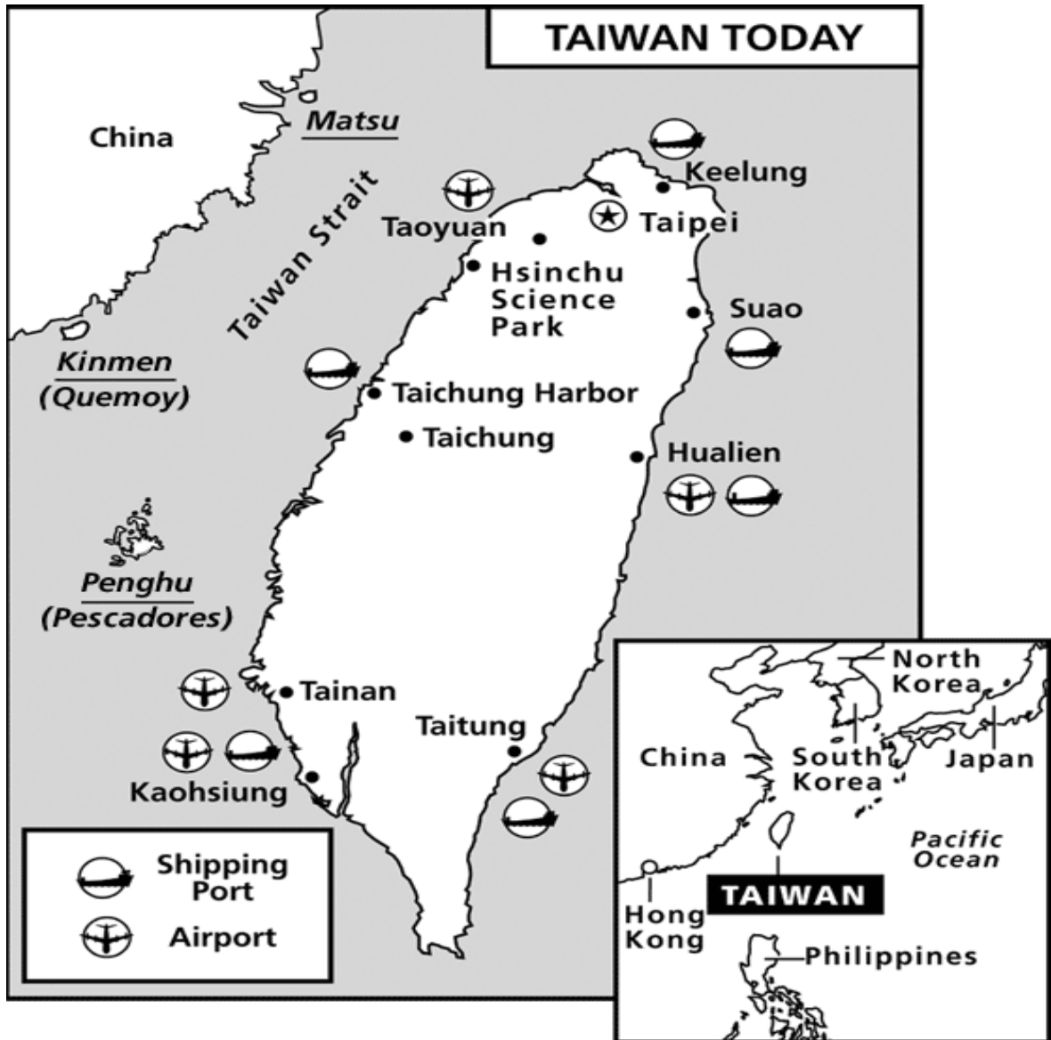
Figure 1-1 Map of Taiwan